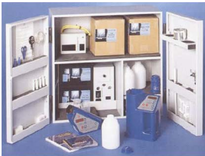
Figure 2 | Onsite portable testing kit.

If we go back to our comparison with vibration, there is use in recording data points continuously and storing them for interrogation at a moment of interest while at the same time setting alarm trends or limits. The readings taken from vibration sensors constitute the only source of vibration data—not so with OA.