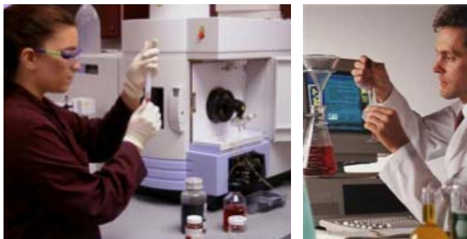
Figure 3 | Offsite, full-service lab with complete testing capabilities.